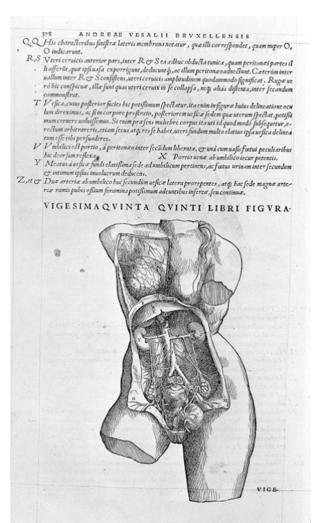
1 – [Anatomy of the Female Urogenital System]. From Vesalius, Andreas, De humani corporis fabrica libri septem (Basel: Joannem Oporinum, [1555]). Wellcome.

Looking at illustrations can give a unique insight into medical culture. Images were used to communicate things hard to describe in text, and so were a crucial tool for disseminating medical knowledge. They also had a very wide cultural reach, accessible to illiterate and semi-literate viewers. While very few people had large personal libraries, cheap and popular medical books abounded, were available to browse at bookstalls, and were shared around by their owners. The images in them were copied into personal notebooks, and sometimes even removed and displayed separately. Single-sheet printed images, sometimes with flaps, were produced specifically to be displayed by medical practitioners of all kinds as reference works and proofs of expert knowledge.