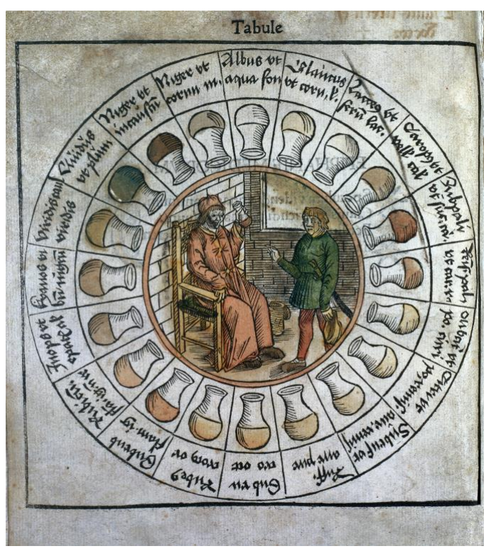
4 – Uroscopy chart. From Pinder, Ulrich, Epiphanie medicorum ([Place of publication not identified]: [publisher not identified], 1506).

Not all medical images were representations of things seen: they could be abstract charts or diagrams that visualized knowledge in other ways. One popular example is the uroscopy chart. Examining the color, consistency, and sediments in urine was a very common diagnostic practice in the early modern <u>period</u>.